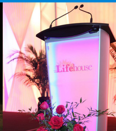
Images from past Unity for Life events.